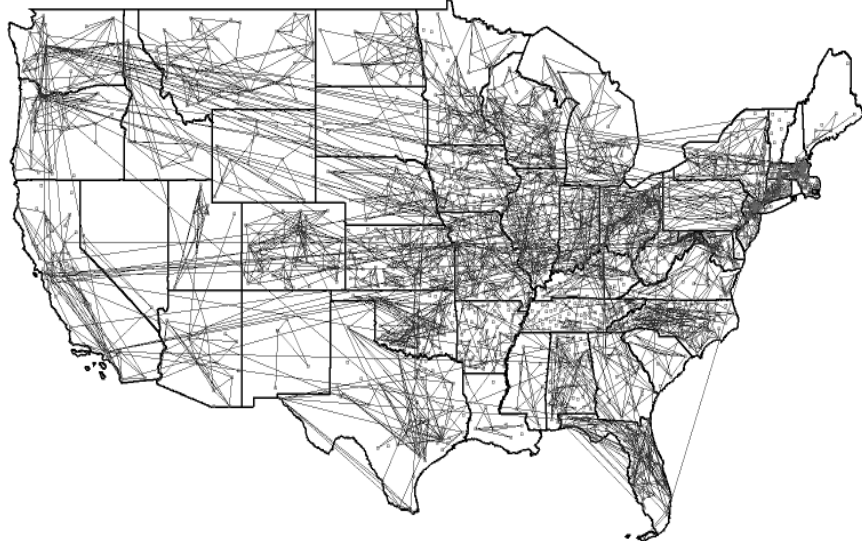
a) health officials' information network