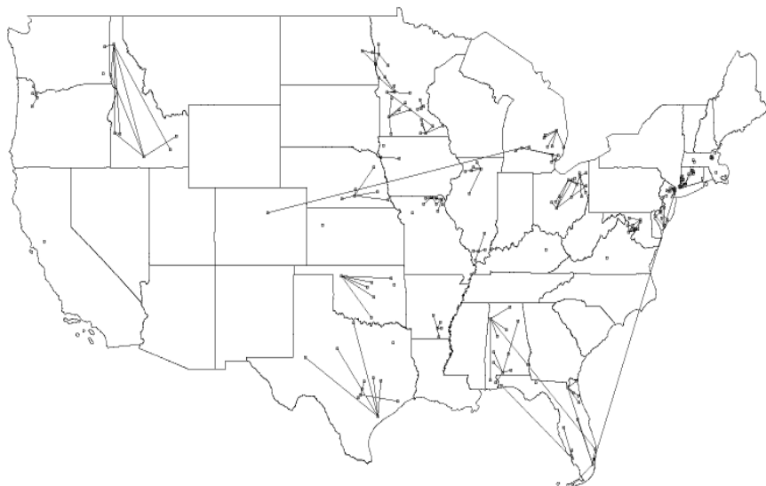
c) information spreaders and their contacts